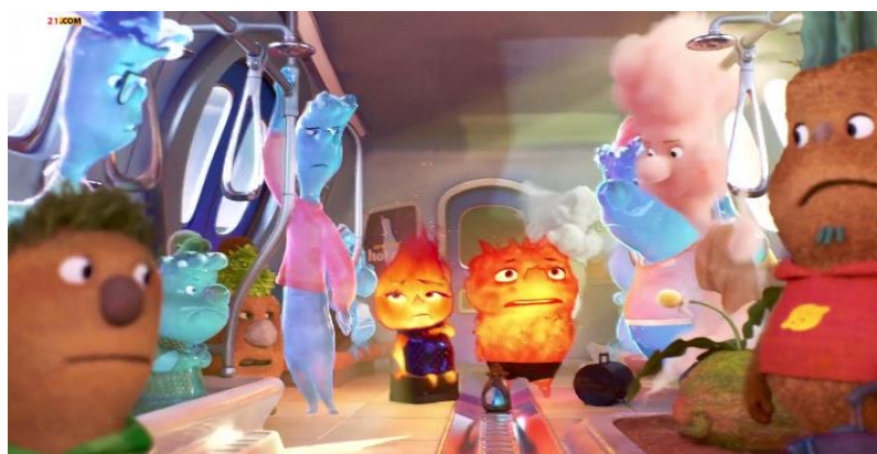
Figure 5. Explicit and Implicit Discrimination - Scene 2

In this scene, Barnie and Cinder quickly boarded a train they had noticed earlier. Inside, they attracted attention as they were using public facilities together, a rare occurrence. They were being watched by locals, predominantly from the water, earth, and cloud races, as other races felt threatened by the presence of the fire race. Amid turbulence, a person from the water race accidentally spilled water on Cinder, extinguishing the fire on her left side. Barnie promptly helped by providing dry wood from his suitcase to reignite the fire. This incident made Barnie resentful towards the water element, especially since Cinder was pregnant, making any mishap potentially dangerous.