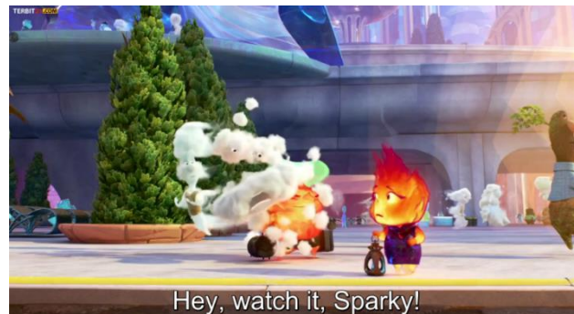
Figure 4. Explicit and Implicit Discrimination - Scene 1

were too engrossed in admiring the city's technological advancements, Barnie accidentally bumped into someone from the cloud race while walking, and the person promptly scolded him by calling him "sparky," according to Barnie's elemental race.