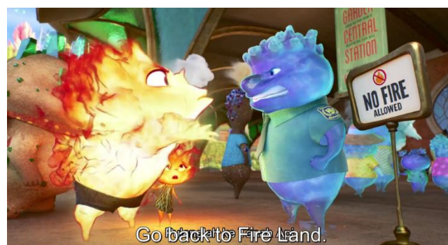
Figure 2. Institutional and Cultural Discrimination - Scene 2

After successfully negotiating ticket discounts, they immediately went to Ember's shop to find the source of the leak. Then, Wade explained the sequence of events from discovering the leak in the canal until he emerged from the water pipe at Ember's house. Next, Ember suggested searching for the leak from the roof, followed by constructing a hot air balloon. On the hot air balloon, they discussed Ember's plan to take over the shop. Ember also shared about Garden Central Station and his disappointment for not being able to see Vivisteria there. Hearing this, Wade felt Ember's fear.