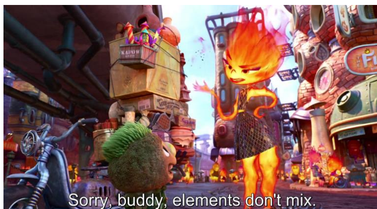
Figure 6. Explicit and Implicit Discrimination - Scene 3

Ember is now grown up and begins managing the family shop. Her father, Barnie, shows signs of aging, coughing severely while working on kol-nuts. Customers suggest Barnie retire and pass the shop to Ember, but Barnie insists Ember isn't fully ready yet. He challenges Ember to beat his delivery record before handing over the shop. Meanwhile, Ember accidentally disrupts his mother's matchmaking services and encounters Clod, a land people teenager, who tries to persuade him to attend a festival. Despite Clod's efforts, Ember firmly declines, content with her life in the city and unwilling to venture into unfamiliar territory.