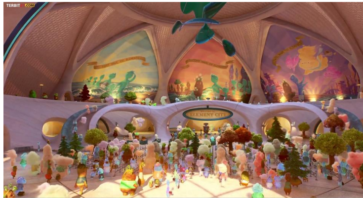
Figure 1. Institutional and Cultural Discrimination - Scene 1

In this scene, Cinder and Barnie, a married couple, are depicted sailing with a small boat and a blue lantern. They are surprised as they encounter hot air balloons and airplanes heading towards the advanced city. Upon arrival, they marvel at the city's modernity, luxury, and orderliness. Their admiration deepens as they witness the advanced technology, grand architecture, and cultural diversity of the city, including various modes of transportation such as aerial routes above the clouds and submarines for underwater travel. However, directly above the document checkpoint wall before entering the city, there is a mural depicting racial hierarchy, subtly conveying the sequence of racial arrivals into the city: water-based races first, followed by land-based races, and finally, cloud-based races. This portrayal hints at social status differences among the inhabitants, despite residing in the same urban environment. Furthermore, in this scene, there is no visible discrimination as they have just entered the city of Element and are still mesmerized by the technological advancements, beauty, order, and structure present there. Therefore, they have not yet realized any discriminatory actions in this scene. Additionally, there are no effects of discrimination felt, either verbally or nonverbally, as there are no dialogues occurring yet.